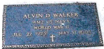
Added by RWCNAC